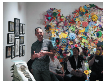
Class is in session at EAC

The Art Center in Highland Park also offers classes and workshops in the visual arts, and they host regular gallery exhibitions, special events and performances for class members and faculty, as well as local artistic talent. Theartcenterhp.org